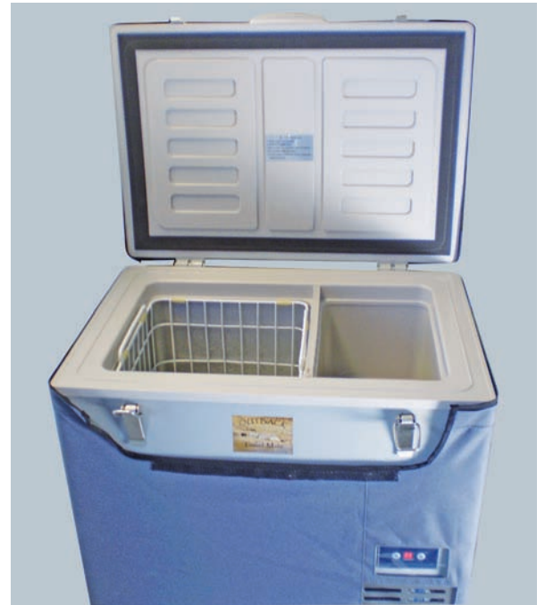
The 55 Litre unit is large enough for a weekend away and very sturdy.

From the outside the unit is clean and simple. The lid and body are constructed from impact resistant plastics with the lid having a