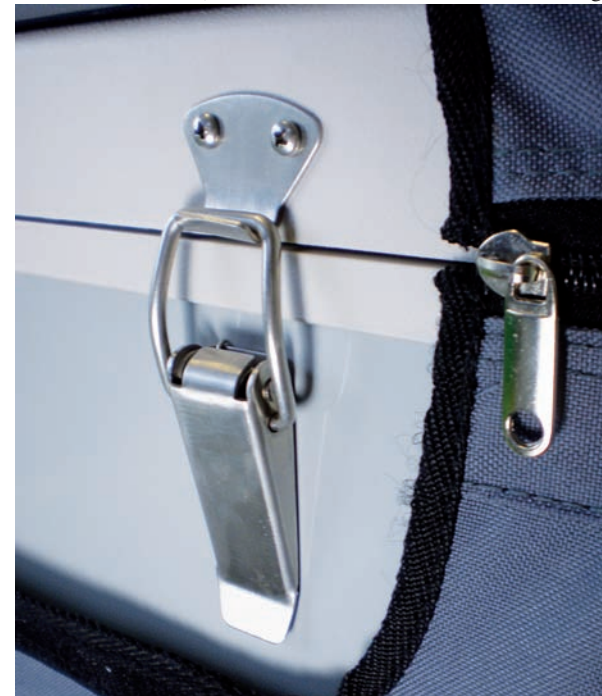
The sturdy latches are spring loaded and strong. They keep the lid securely down to keep in the cool.

and feel about them that they were about to defrost and the drinks in the fridge part were still refreshingly cool – not as cold as I'd like, but I'd