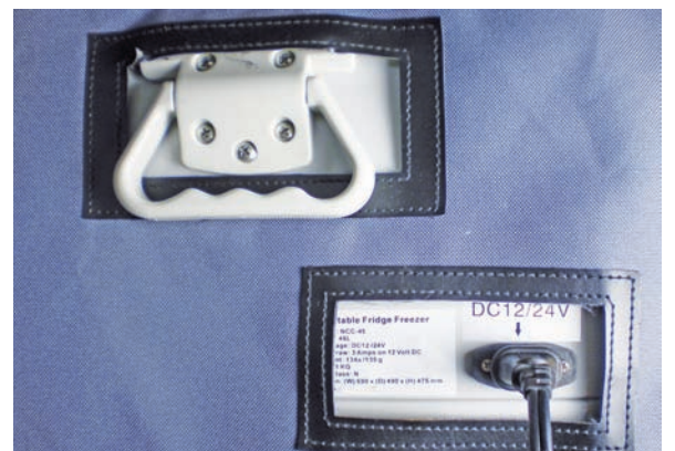
Strong handles on the side make carrying the unit a breeze and the power outlet is easy to access through the canvas outer bag.

If you are struggling to locate one, log onto www.downundericeboxes.com or give them a call on (07) 5437 8477. The Outback Travel Mate makes travelling with perishable goods easy.