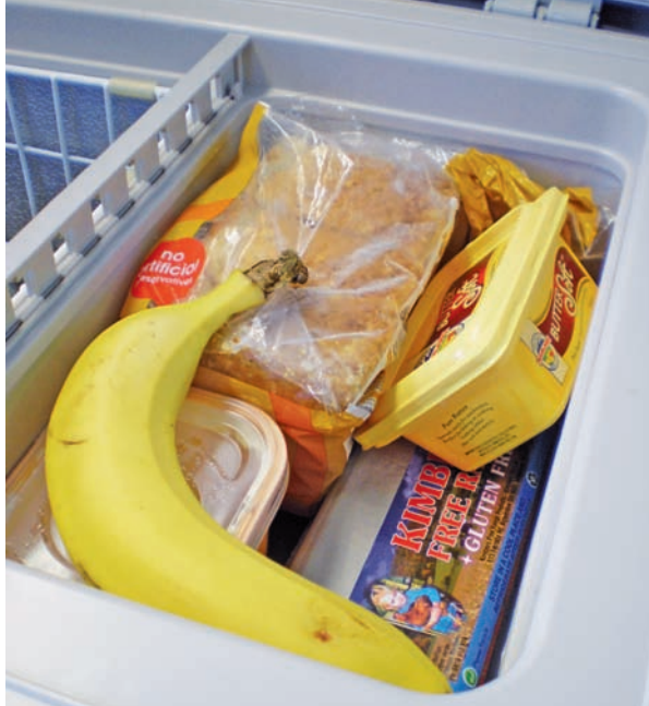
The smaller fridge compartment is perfect for all those things you want cold but not frozen.

The frozen goods were just starting to get that look