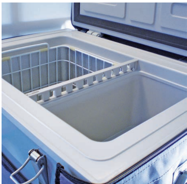
Neat, clean lines make this an easy unit to clean if you spill food or drink in the unit.

The biggest trip the Travel Mate went on was up to Bundaberg and Lake Monduran. We stay at a fantastic campground called Baffle Creek Camp Stay and the trip in is virtually all sealed road now. But the car gets stinking hot and our coolers we used to carry the food up in often had the meat defrosting and the milk just getting above that temperature I am comfortable with. The Travel Mate comes with a car power adaptor and when I got the fridge they threw in a